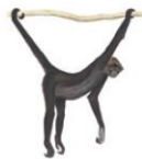
Neuweltaffen (Platyrrhini) 175 Arten