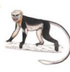
Schlank- und Stummeltaffen (Colobinae) 78 Arten