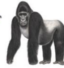
Menschenaffen (Hominidae) 7 Arten